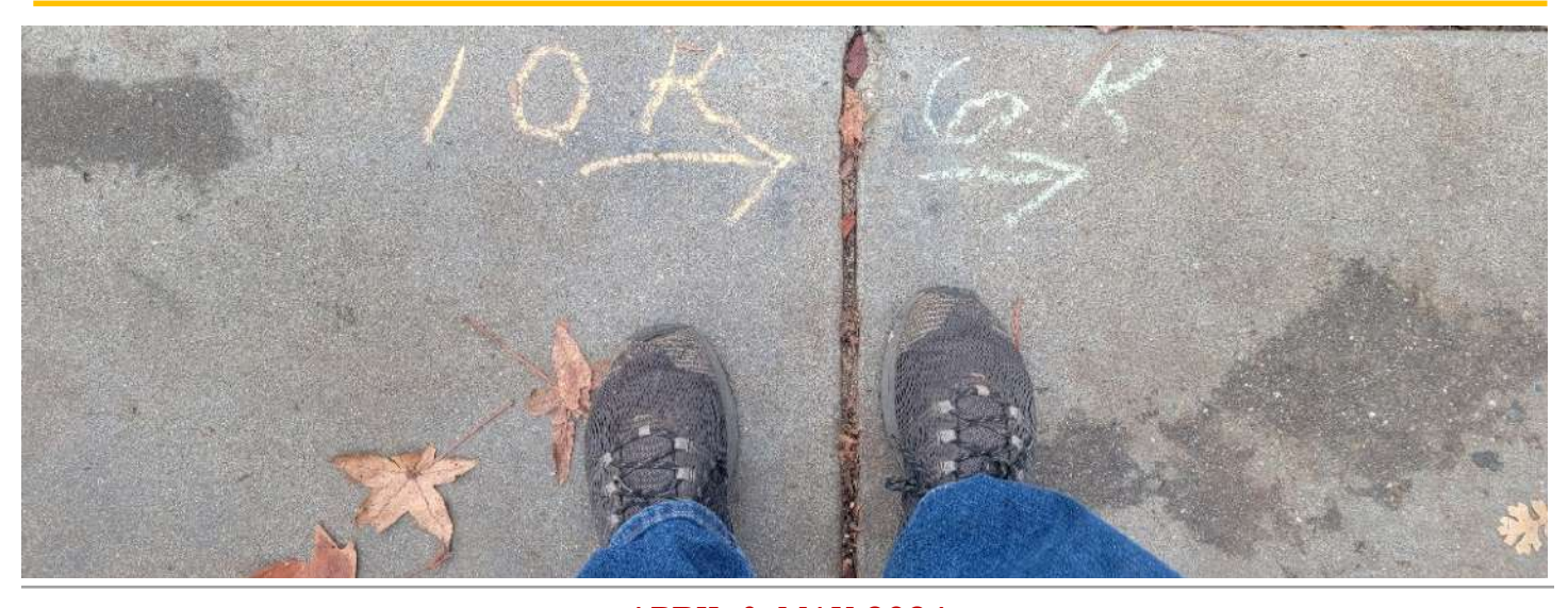
APRIL & MAY 2024

Sincerest apologies if I overlooked anyone. .