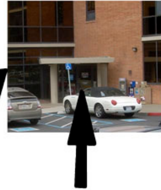
The Entrance closest to the Greenhouse Cafeteria

The pictures above show the front of the hospital along J Street. There are several entrances. The closest entrance is the most easterly one. You will go through two sets of doors and the entrance to the Greenhouse Cafeteria will be obvious.