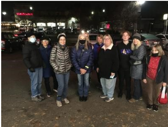
T Street "lighted arches" Holiday Lights Walk.

light parade/show they had each night. My last bit of luck was stopping at the little free library. There was a cute 1000 piece puzzle that I brought home and spread out on our table. We have been having a fun time putting it together throughout this rainy couple of weeks. SO: great hike, great food, great shopping and a great free puzzle. Can hardly beat it.