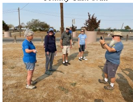
Passing the baton