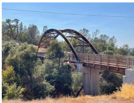
Robber's Ravine Bridge, Johnny Cash Trail